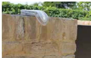
Horizontal installation on column