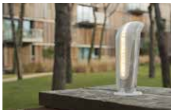
Vertical installation on column

Courtesy light: fixed white led light commanded by an internal crepuscular sensor. Courtesy light is automatically activated independently from the automation (with 14A control board)