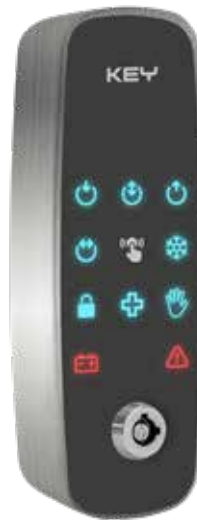
SEL2 Wired manual selector with key