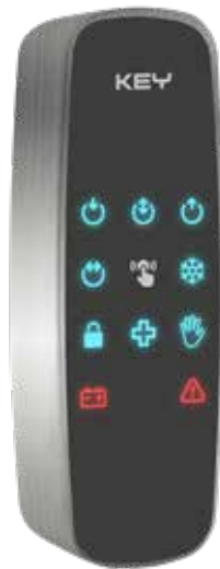
SEL1 Wired manual selector without key