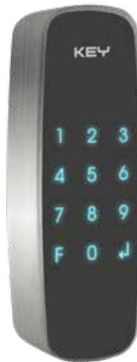
SEL4 Wired keypad