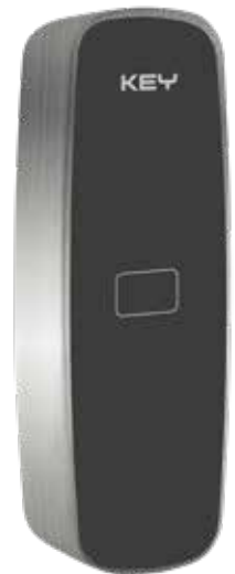
SEL5 Wired proximity reader for transponder cards