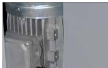
Sturdy and high-performing motor