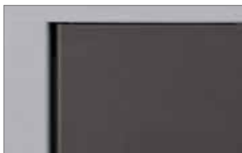
Anti-UV rays coating

With 400 Vac control unit CT-400 Electronic and mechanical parts well protected from external debris